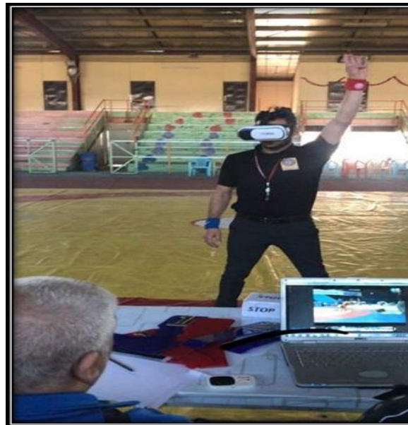
Indicates referee evaluation test.